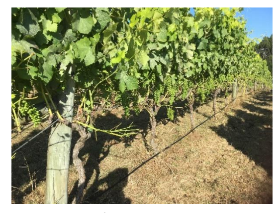
Pinot Noir post-leaf plucking the vines using sheep around Christmas

In spring fungicide spraying starts in earnest. We could spray 15-20 times/season, (more than a conventional vineyard). The programme is based on proactive application of sulphur sprays with restricted use of copper. Without herbicides weed control is by under-vine trimming and cultivation (with variable success), complemented by regular inter-row mowing. Sheep are also used in winter and at times in summer for leaf plucking around the fruiting zone.