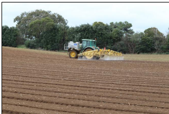
Production activities tend to result in further land loss

We as agronomists need to support the protection of this valuable resource to ensure highly productive soils remain for future generations of food production.