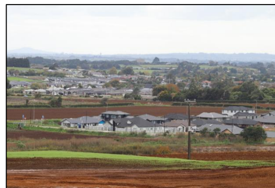
Housing encroaching onto elite soils in Pukekohe

1 & 2 land - the best cropping land in New Zealand. The paper referenced calls for national attention to protect this land. A documentary broadcast on TV1 earlier in 2021, draws attention to this important & urgent issue 2 .