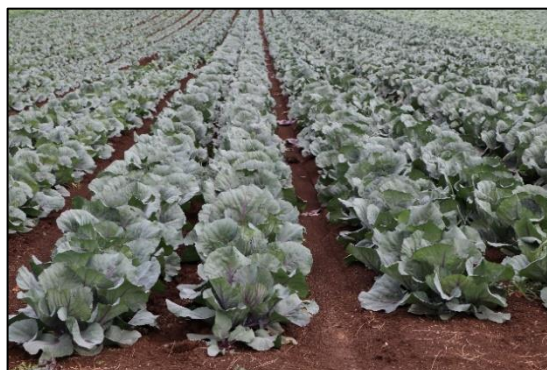
Under threat: Pukekohe vegetable production

In 2017, Statistics NZ data reveals that the Auckland region – primarily Pukekohe – had the largest single outdoor area used for growing vegetables and herbs – 6,574 ha – about 19% of NZ's total vegetable production area. However, the Auckland region has had the greatest loss of LUC 1, 2 & 3 classed land, some 40%, 44% & 25%, respectively, over the nearly two-decade study period. Not only is this a tragic loss, but unless arrested is an ominous sign for future generations of New Zealanders. This ongoing fragmentation & development is reducing the availability of this highly versatile LUC